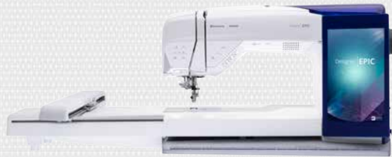
Designed and engineered in Sweden - MADE FOR SEWERS, BY SEWERS™.

Whether you're sewing, embroidering or quilting, the DESIGNER EPIC™ machine will help you fulfill your greatest creative ambitions. We've developed the most technologically advanced machine, yet the simplest to use including: