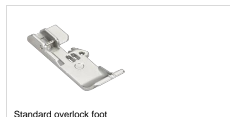
Standard overlock foot