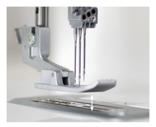
Adjustable Presser Foot Height up to 6mm

Knee Lift Raise the presser foot by simply moving the attachable lever with your knee. This leaves both of your hands free for extra control.