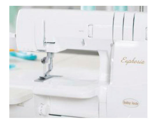
Large Throat Space Easily stitch on large projects and use optional attachments with room to spare.