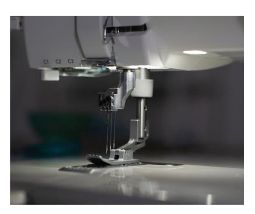
Pure Lighting with 3 LED Lights Clearly see every stitch, fabric and thread color under three bright LED lights.

Use the needle threader for quick and easy threading of each needle with just the touch of a lever.