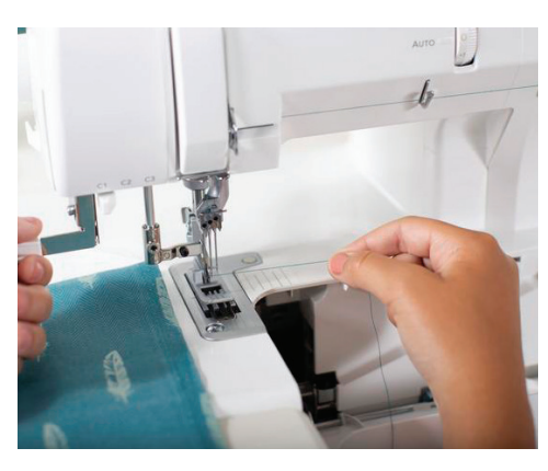
Needle Threading System

With just a gust of air, ExtraordinAir instantly takes thread through the looper. Threading has never been this fast, easy or extraordinary!